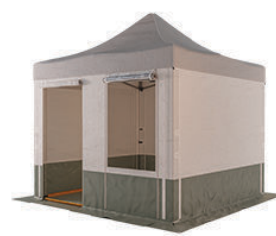
FRZ PRO 33